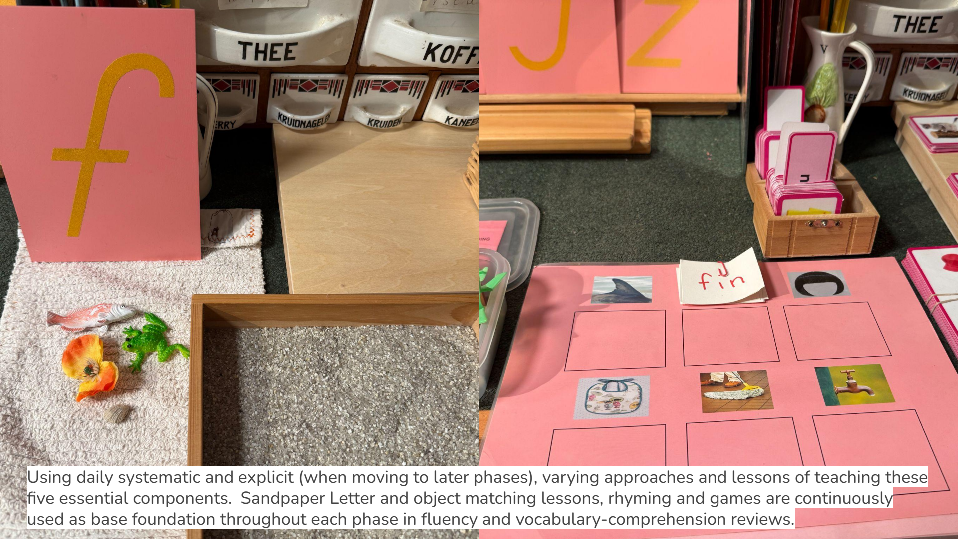
Using daily systematic and explicit (when moving to later phases), varying approaches and lessons of teaching these five essential components. Sandpaper Letter and object matching lessons, rhyming and games are continuously used as base foundation throughout each phase in fluency and vocabulary-comprehension reviews.